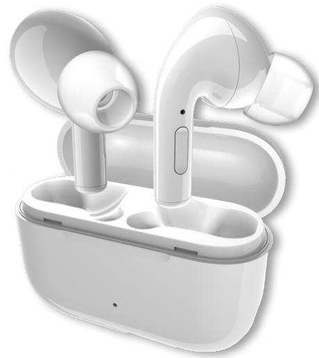
A2 Wireless Earbuds (Color and Style May Vary)