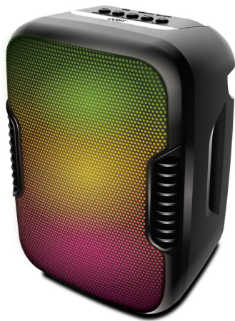
A3 Flame Speaker Bluetooth® (Color and Style May Vary)