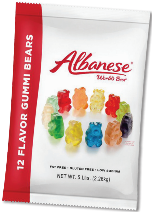
*A1 5lb. Bag of Gummi Bears