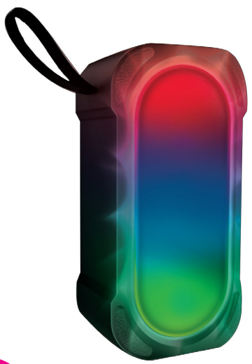
LED ORB LIGHT (Color and Style May Vary)