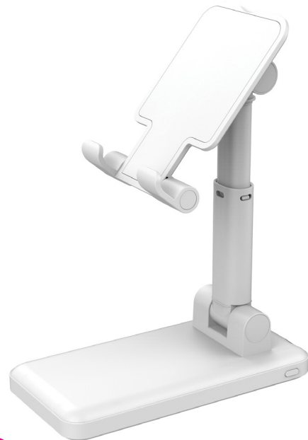
A4 Cell Phone Holder & Charger (Color and Style May Vary)